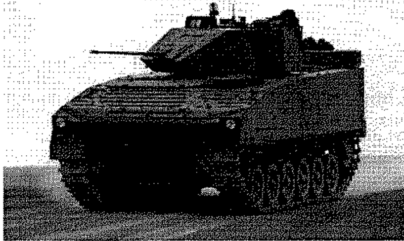
The Bionix 25 Medium Armored Vehicle